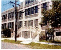
Corpus Christi – Epiphany Community Resource Center